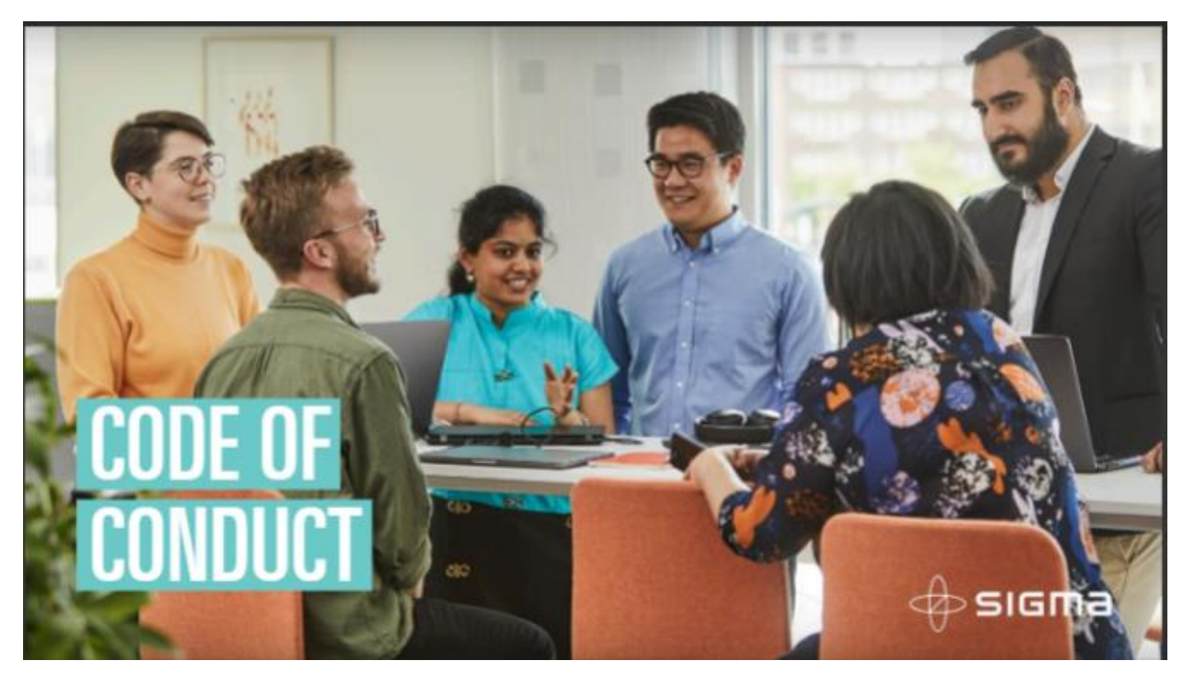
The Code of Conduct is available internally on the intranet and externally on our website <a href="https://www.nexergroup.com">www.nexergroup.com</a>