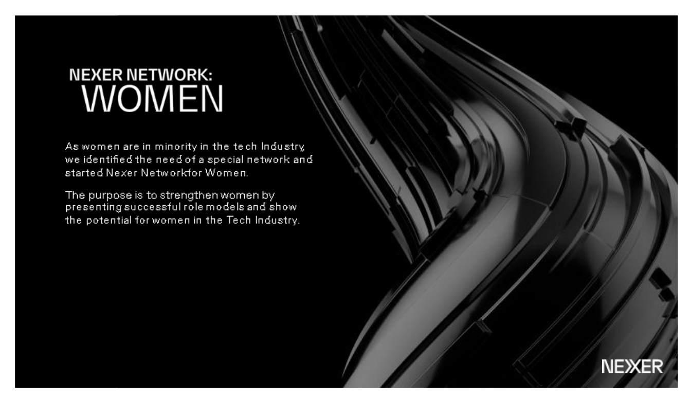
Caption: Nexer organises an all-female network for women in the tech industry.

During 2020 we changed into digital events due to Covid-19 pandemic, and the response was very positive. The events were recorded and the content was shared on the website for further inspiration and knowledge sharing.